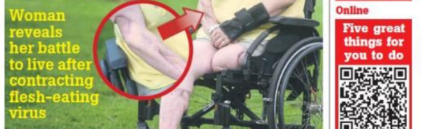
FULL STORY PAGES 8&9