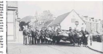
Taken in 2010 with the Victorian era camera, the photograph has helped inspire RNLI volunteers' fundraising.

Julie Douglas The town of North Berwick Lifeboat Station are equipping the boat out for their latest fundraising venture. Volunteers from across the station have pledged to climb North Berwick Law everyday for a month in support of the RNLI's Mayday Mile campaign. In support of a photograph of the crew with the iconic lighthouse in the background, the challenge will see them walk more than three miles a day - from the beachhouse to the summit and back again - checking in with the station several hundred times in total. Laura Anderson, chair