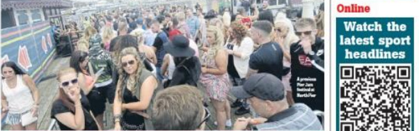
FULL STORY PAGE 7