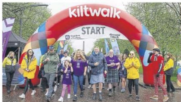
Well plaid: Kiltwalkers stride out in aid of hundreds of charities