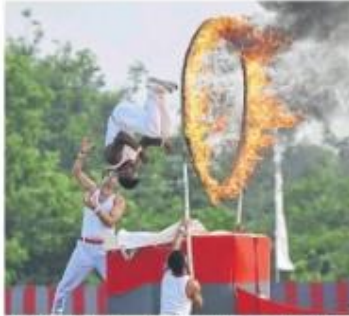
Cadet in India performs a stunt on a large, circular, golden structure at an Indian academy.