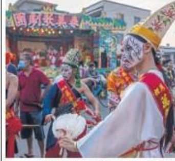
A person in traditional Chinese opera costume performing on stage.